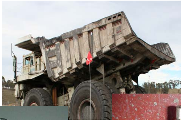
General arrangement of cap installed on Drive motor oil reservoir