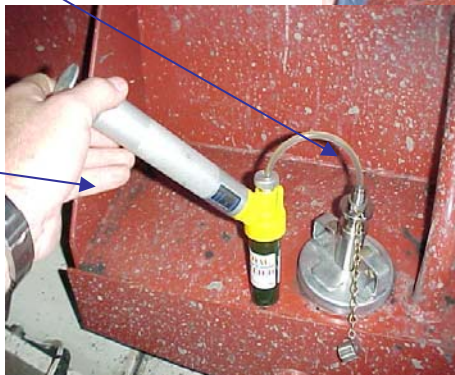
Accurate, clean & reliable method for taking oil samples