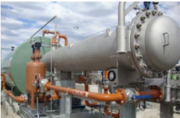
Fuel Farm Installations, Upgrades & Maintenance