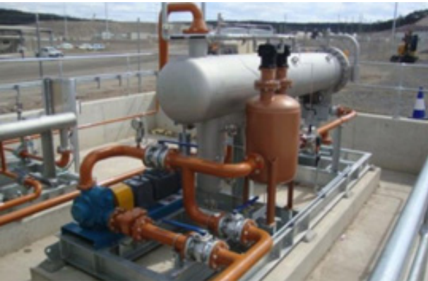
Skid Mounted Coalescer/ Filter/ Pump Systems