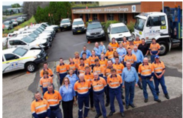
Service Team for Support