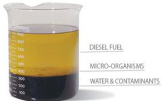
Figure 2 - Sample of Contaminated Diesel Taken from an onsite Fuel Farm

Integrated Reliability Solutions provides complete management of bulk fuel facilities that include new facility design, upgrade design, project management, fuel management programs, installation, product supply and complete integrated logistical support. Our systems are design to comply with Australian Standards AS 1940.