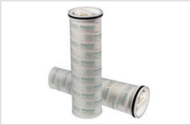
Replacement Coalescer & Filter Elements

Mining, Rail, Marine, Defence & Transport industries.