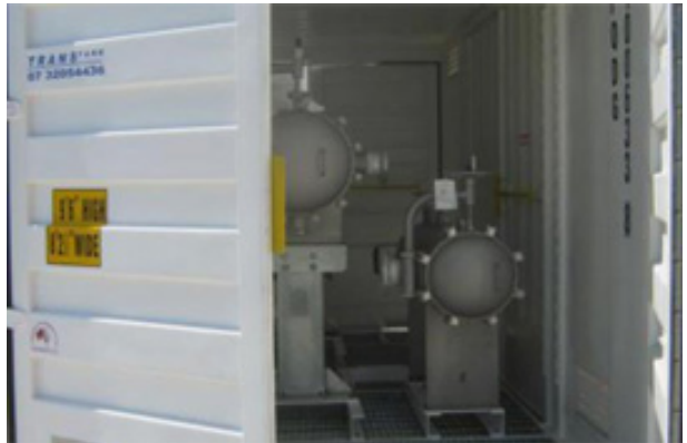
Containerised Coalescer/ Filter/ Pump Systems