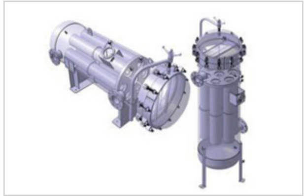
Fuel Coalescer & Filter Housings